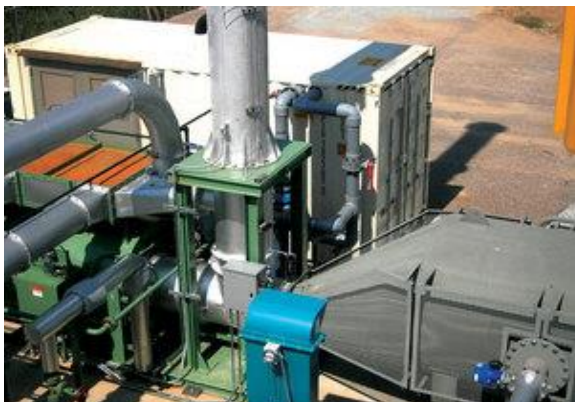
gasification / pyrolysis