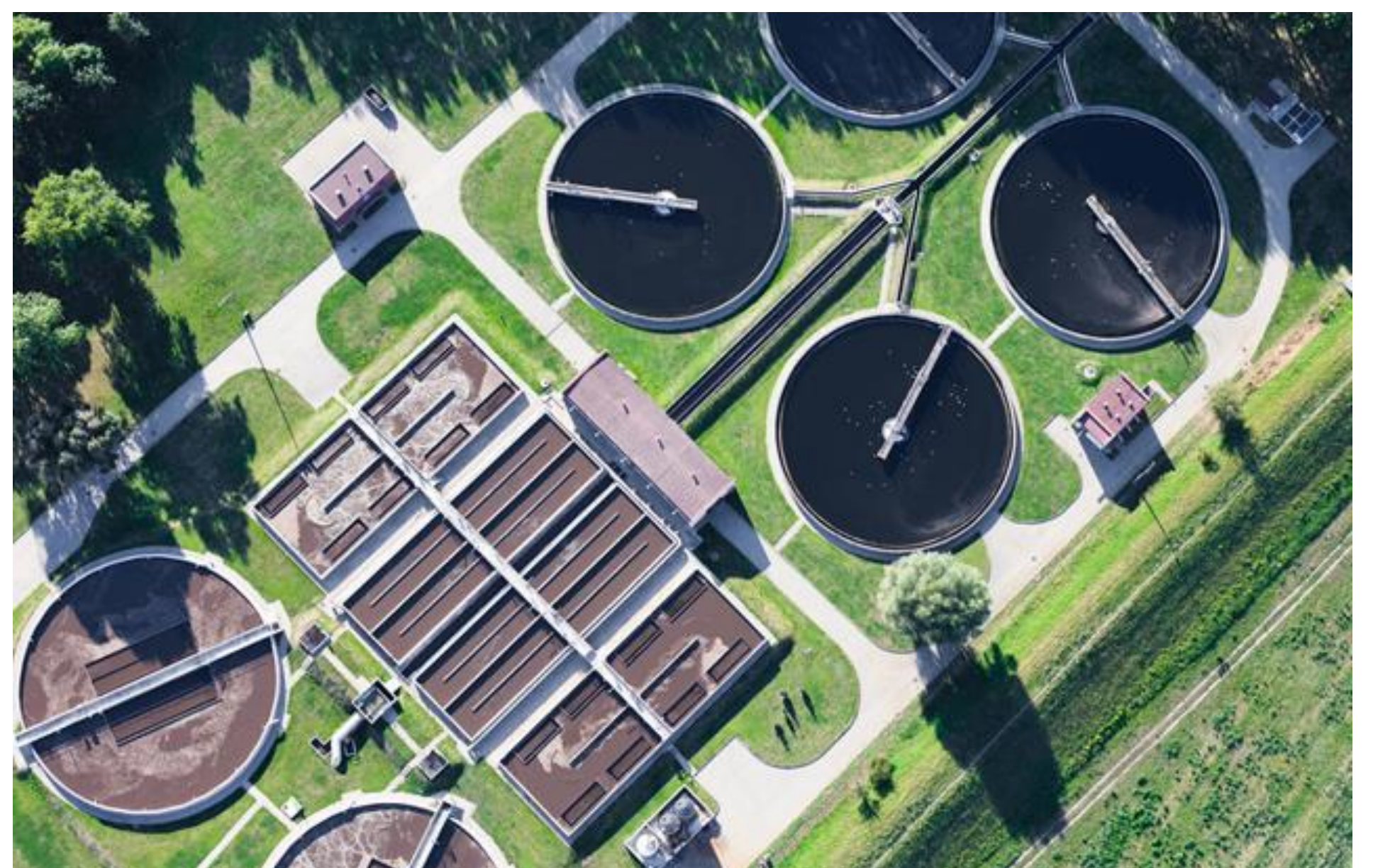
co-digestion with sewage