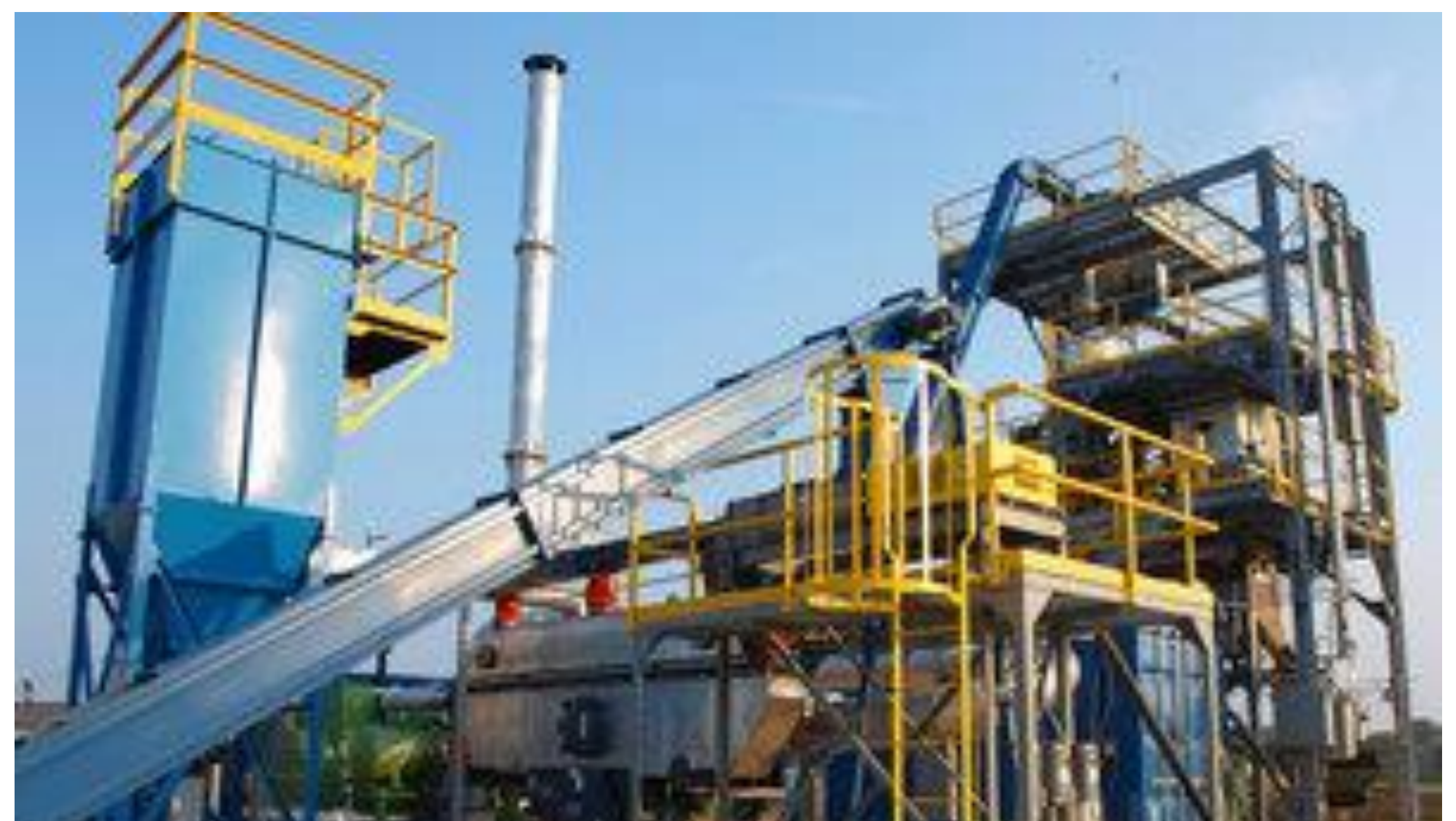
incineration and waste-to-energy plants