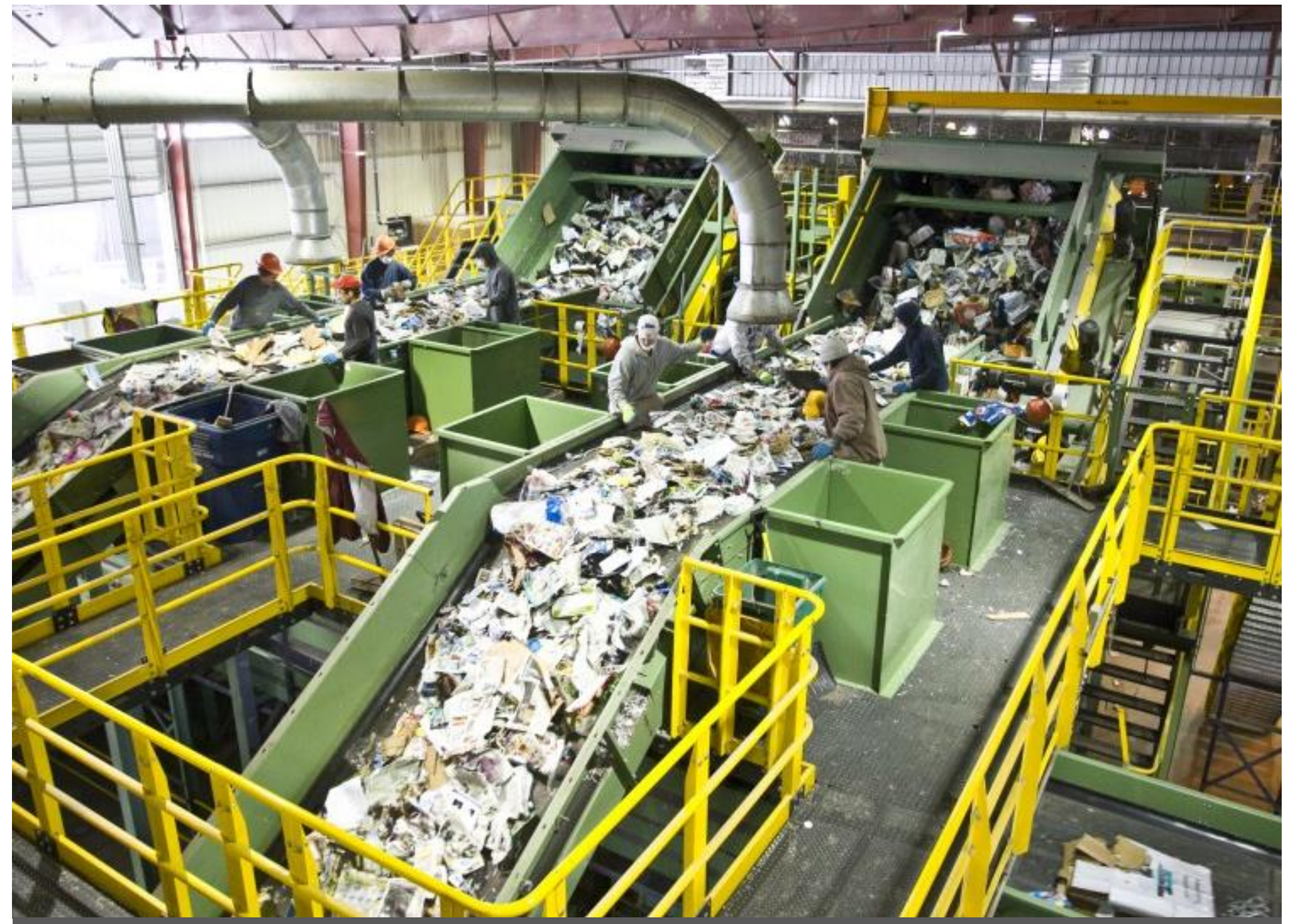
material recovery / sorting