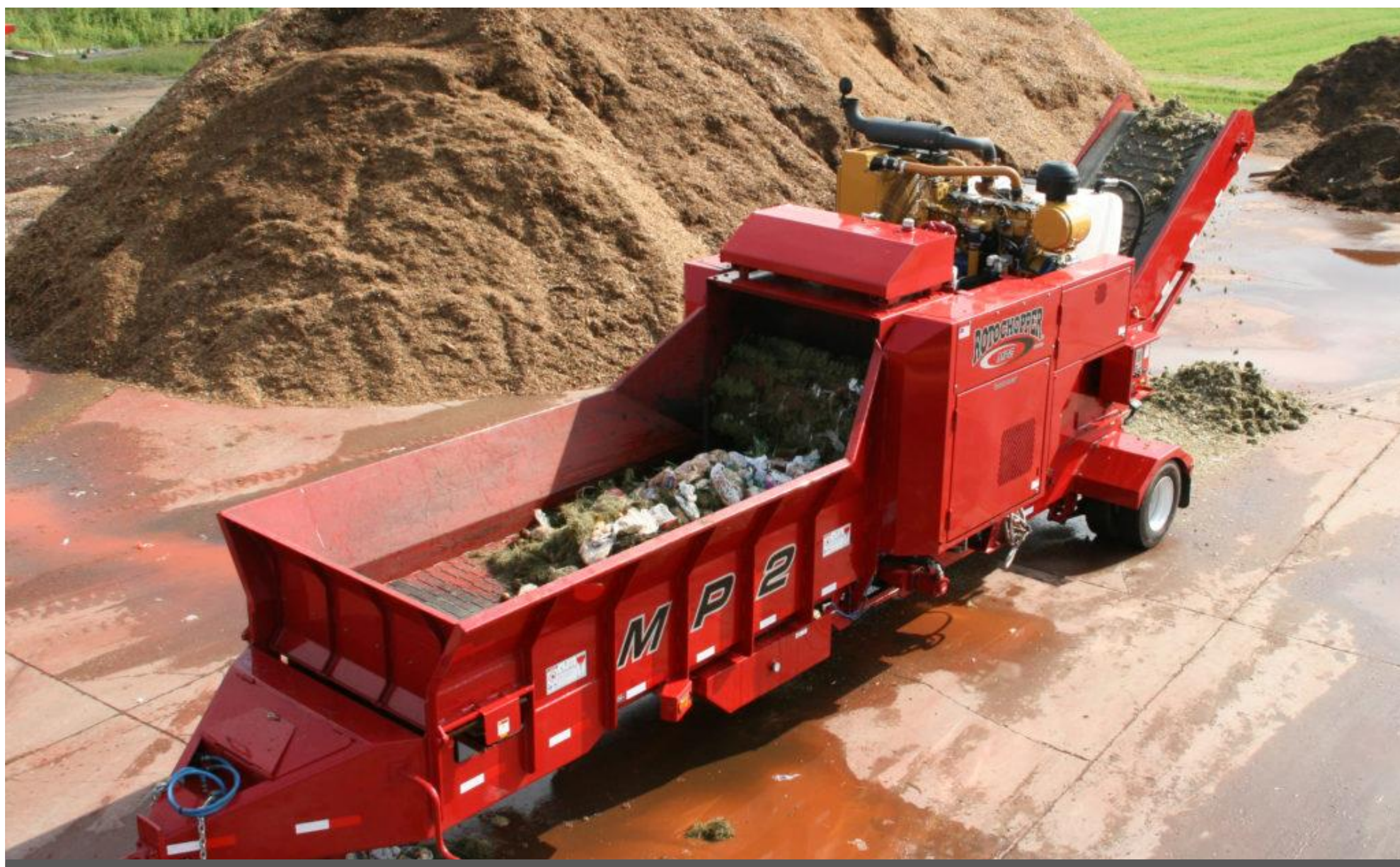
chipping and grinding