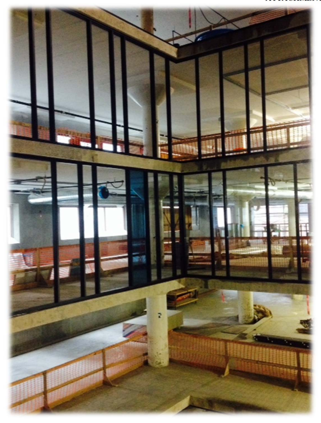
Figure 4: Mock atrium glass enclosure on Level 6 & 7.