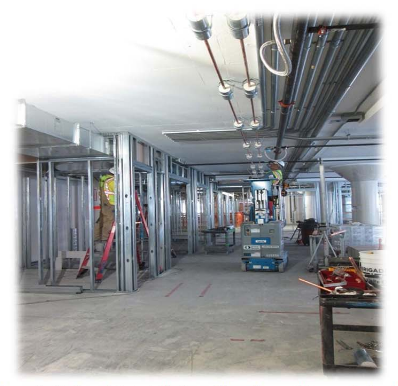
Figure 1: On Level 6, installation of framing, utilities and plumbing overhead.