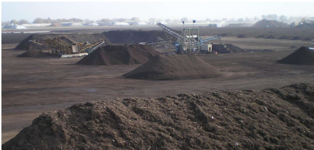
Figure 2a: Screening of Finished Product at a Large-Scale Composting Facility

Concurrent with the development of Regulation 13, Rule 2, the Air District is developing Regulation 13, Rule 4: Sewage Treatment Plants and Anaerobic Digesters to minimize emissions of greenhouse gasses and VOCs from anaerobic digesters and sewage treatment plants. The proposed rule would implement portions of the 2017 Clean Air Plan and is intended to create a consistent regulatory framework for these operations. In addition, the Air District is working on amendments to Regulation 8, Rule 34: Solid Waste Disposal Sites to better address emissions of methane and non-methane VOCs from solid waste disposal facilities and improve compliance and permitting for these facilities.