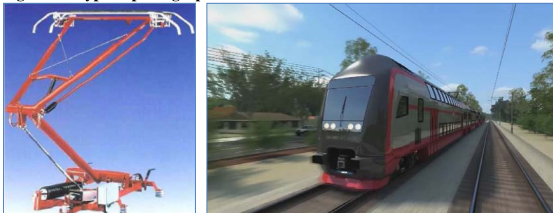
Figure 2: Typical pantograph and EMU

On January 8, 2015, the Peninsula Corridor Joint Powers Board (Caltrain) certified and adopted the Final Environmental Impact Report (FEIR) 1 for Caltrain’s Peninsula Corridor Electrification Project pursuant to the California Environmental Quality Act (CEQA). Table 1 below details the current schedule for the project.