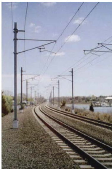
Figure 1: Example of OCS Two Track Arrangement with Side Pole Construction (FEIR)

The Project will require the installation of 130 to 140 single-track miles of overhead contact system (OCS) to supply electrical power to the EMUs. An example of the OCS design is shown in Figure 1 . The actual design will vary along the tracks based on a track segment's configuration, and other site-specific requirements and constraints. The OCS will be powered by a 25 kilovolt (kV), 60 Hertz (Hz), single-phase, alternating current (AC) supply system. This power supply, distribution system, and voltage would be compatible with the requirements of the California High Speed Rail (CHSR) system, and would accommodate future CHSR/ Caltrain Blended Service in the Peninsula Corridor.