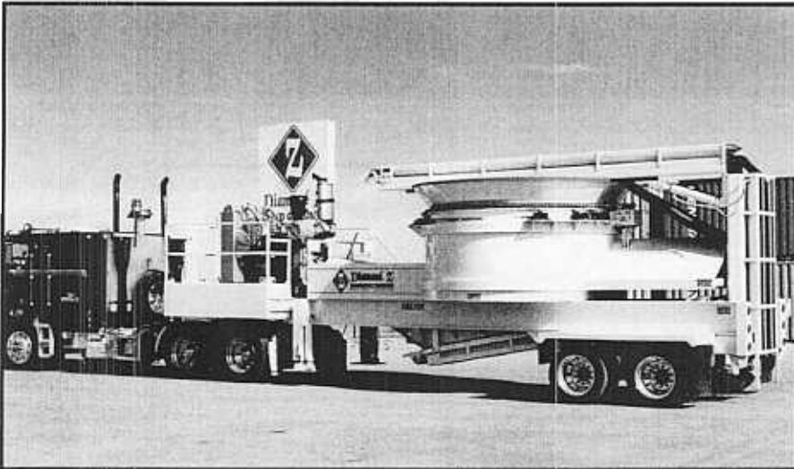
The Diamond Z Grinder will easily grind landfill waste, pallets, demolition and limbs 36" and under in diameter.