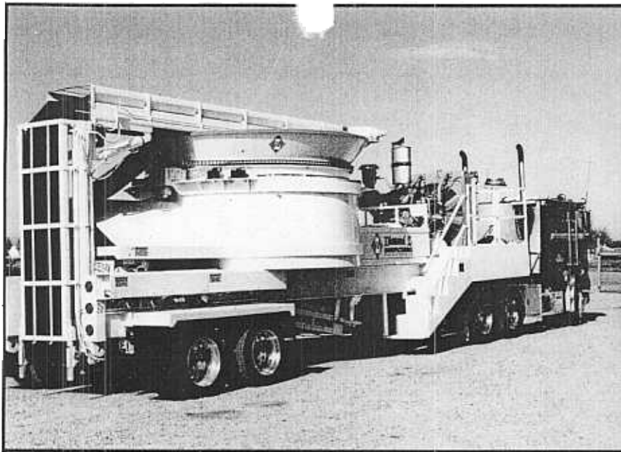
Conveyor folds conveniently and easily over tub for transport. Setup time and transport preparation time under 5 minutes.