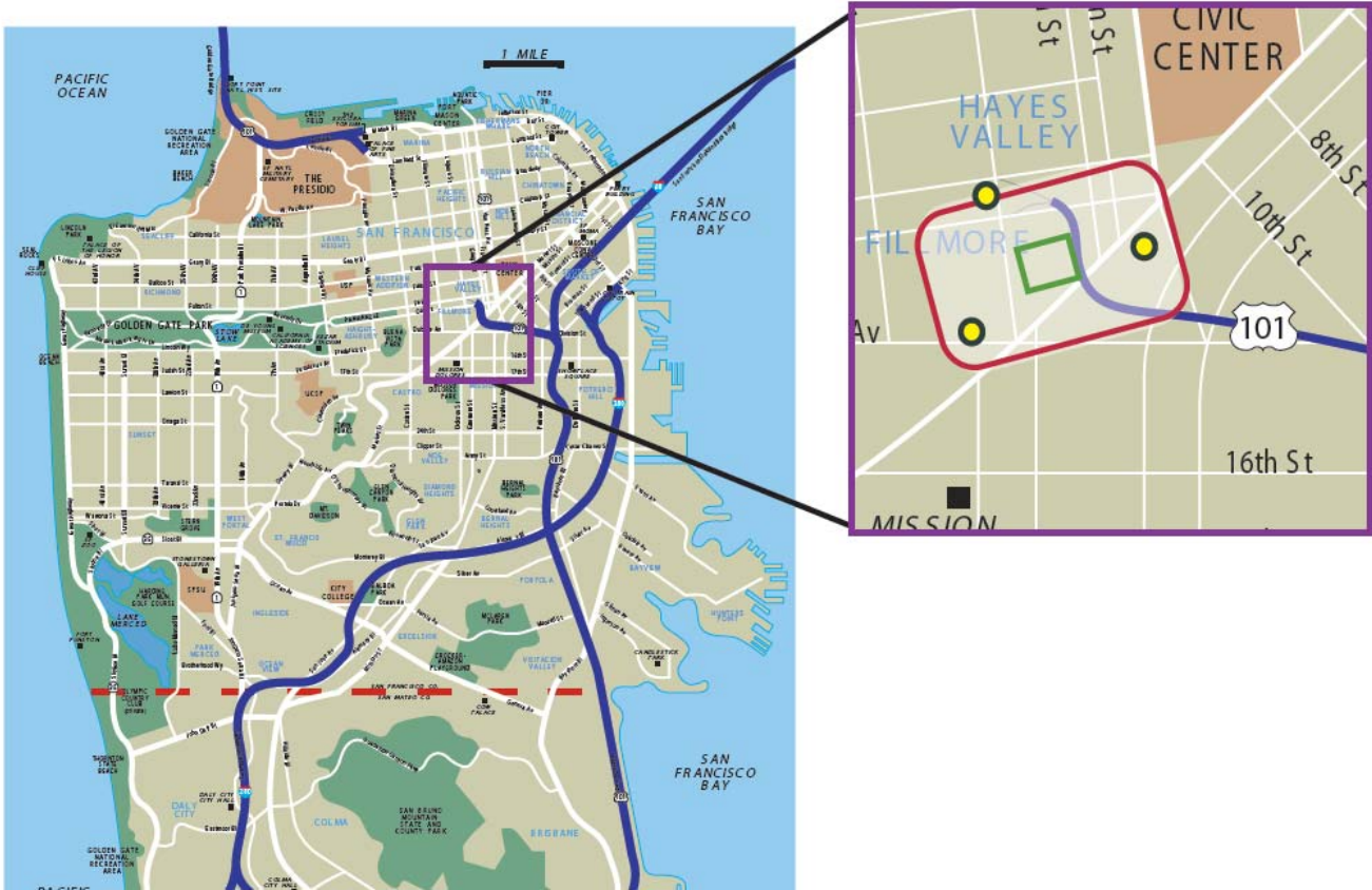
Figure 1. A hypothetical example of CRRP plan area, sensitive receptor area, and area of influence. The plan area may correspond to a city’s boundaries (in this example the City and County of San Francisco; left image, red dashed line and coastline); the sensitive receptor area may correspond to a city parcel (right inset, green rectangle); the area of influence (right inset, red rectangle) is 1,000 ft from the sensitive receptor area. Stationary sources (right, small yellow circles) and roadways are shown in and adjacent to the area of influence. Many such sensitive receptor areas need to be considered in developing a CRRP for a large city.