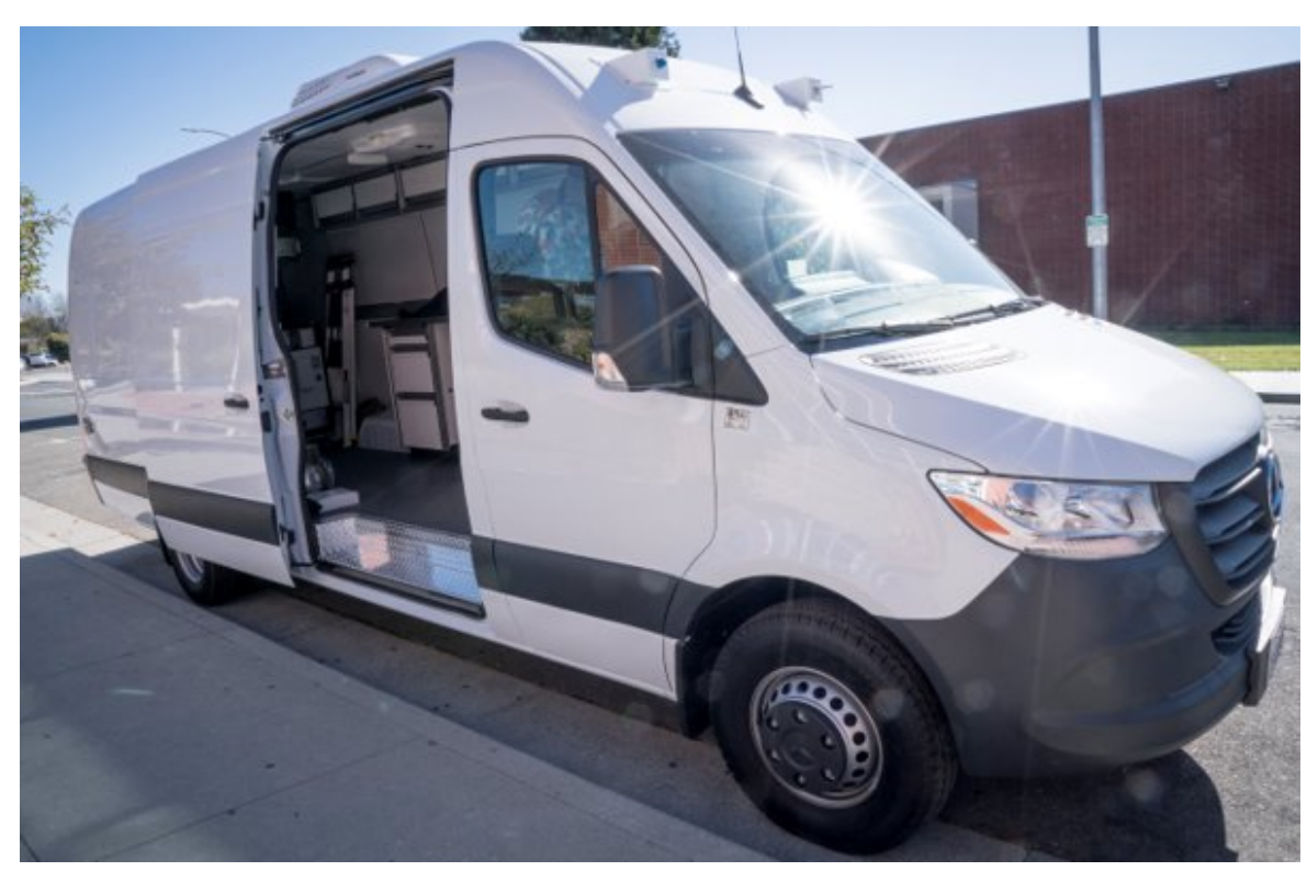
Air District's mobile air monitoring van