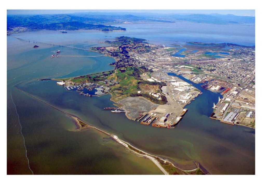
AB 617 Richmond-San Pablo Community Air Monitoring Plan

Cover of the Monitoring Plan showing an aerial image of part of the Richmond/San Pablo study area