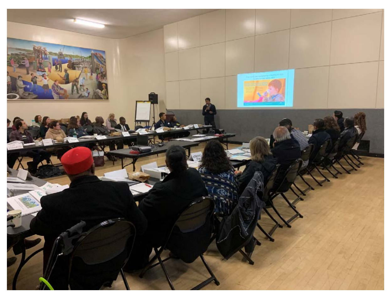
In-person meeting of the Community Steering Committee