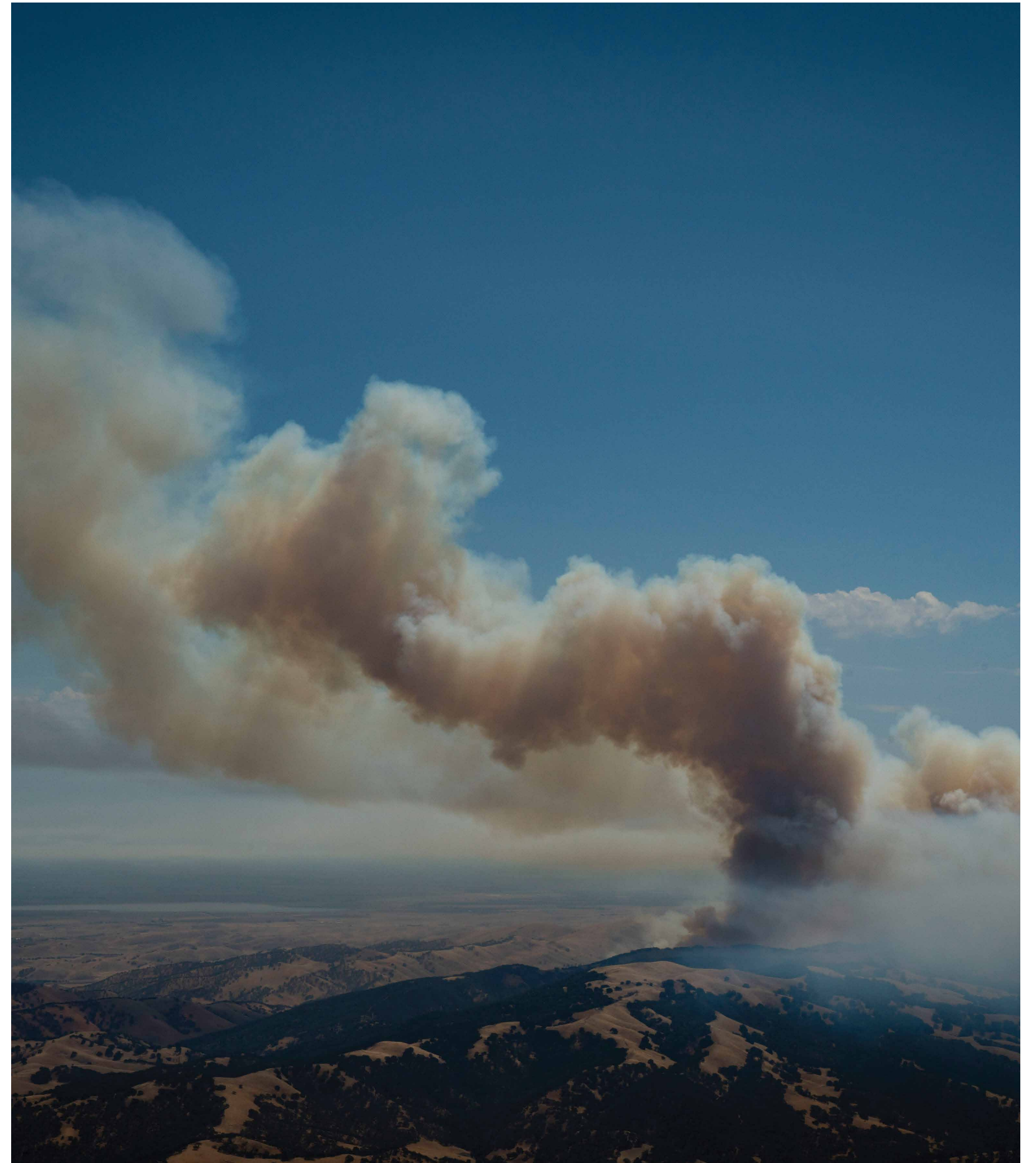
Smoke plume from the August 2020 Marsh Fire