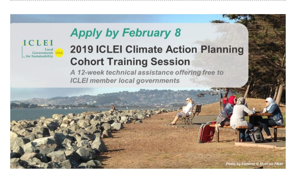
ICLEI Climate Action Planning Cohort Training Opportunity: Apply by Feb 8

Is your city or county planning to complete or update a climate action plan,