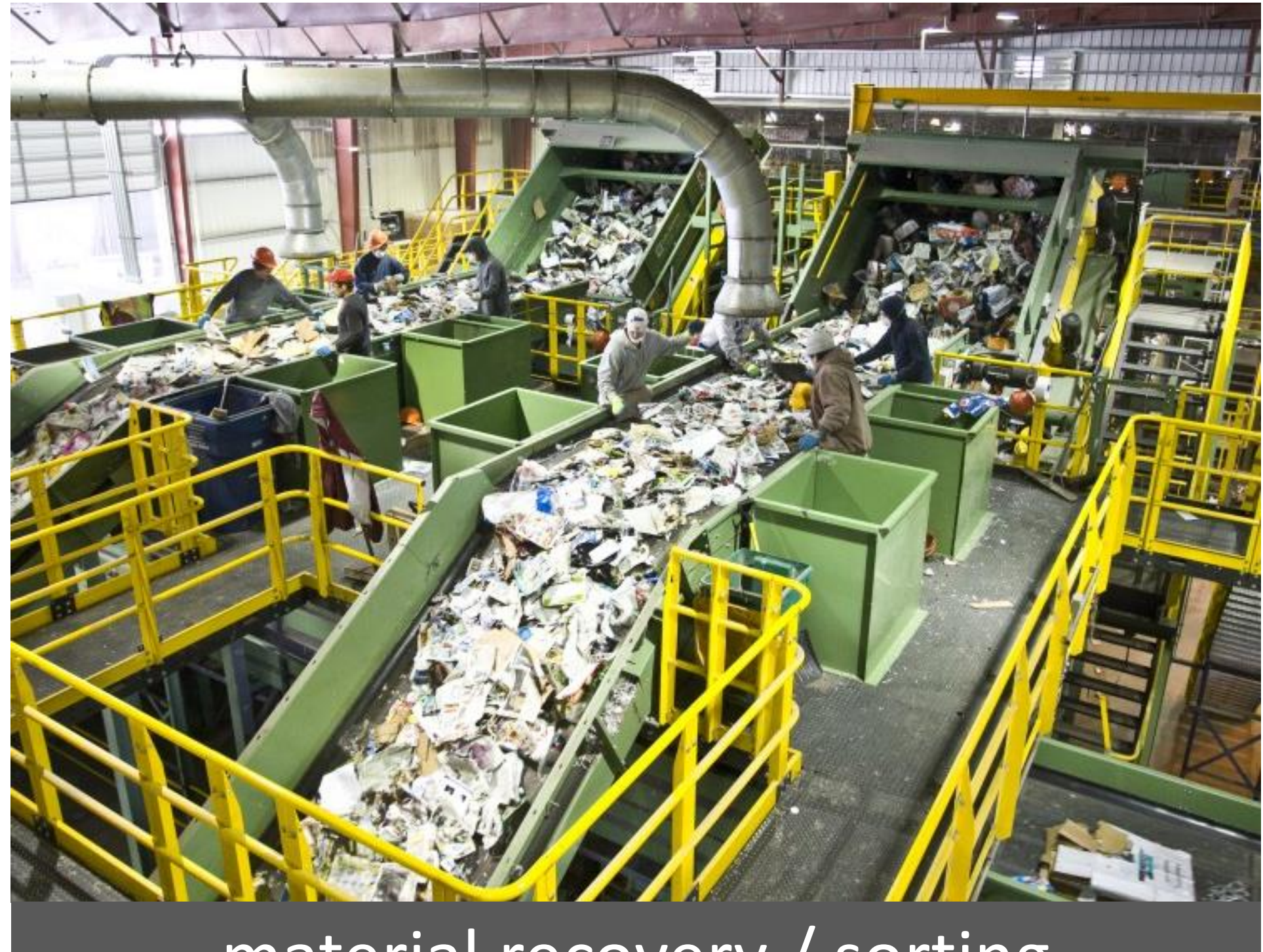
material recovery / sorting