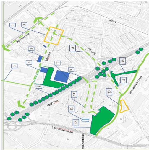
Left: Neighborhood Plan to increase trees as biofilters along and within the freeway ROW (e.g., at interchange areas). View of East Oakland along the I-880 freeway at 98 th Ave. (map by Air District staff).

There are many potential opportunities to introduce trees within the large, landscaped areas around freeway interchange and ramps. Already, many freeways in urbanized areas have some form of sound wall barriers that can be further improved and “greened” for air pollution mitigation including placing layers of trees alongside them or weaving next generation green vegetative components in as part of the wall. Freeway rights-of-way, in some cases, may also provide opportunities to install parallel active transit bike paths (bike highways) that are separated from vehicular traffic by various layers of the above-mentioned greening enhancements. 1