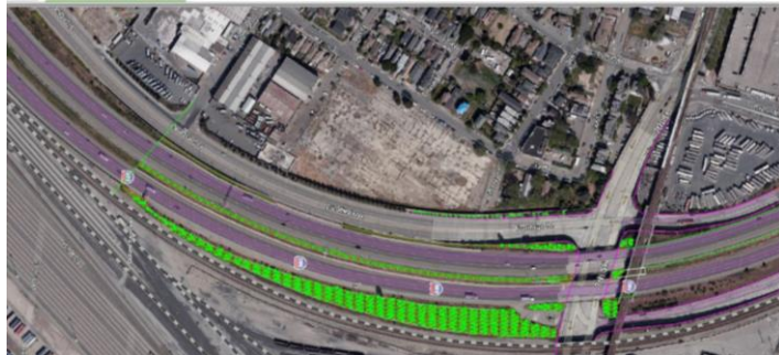
Above: Proposed biofilter greening locations within Caltrans ROW in West Oakland (map by Urban Biofilters/WOEIP as part of an Air District directed study, 2018).

In 2018, the Air District received a State Transformative Climate Community (TCC) planning grant to work with Urban Biofilters and the West Oakland Environmental Indicators Projects (WOEIP) to model, study, and design an appropriate biofilter/urban forestry strategy within the freeway ROW that could mitigate vehicular pollutants and significant diesel PM from port truck along 7 th Street (See map above). The project as modeled would have many air pollution health benefits over 40 years including the sequestration of carbon/GHG and the removal of 360lbs of PM 2.5. In addition, the project would help reduce health care costs for adjacent residents and provide stormwater runoff reduction and filtration benefits.