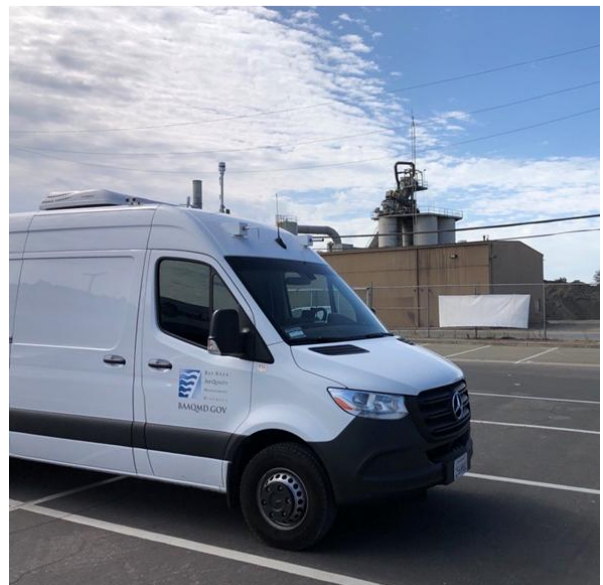
Photos of the Air District's air monitoring van in East Oakland